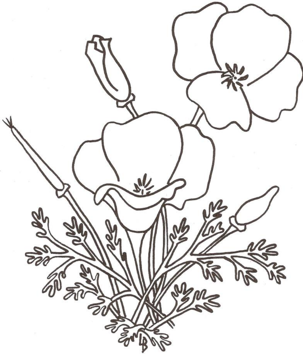
CALIFORNIA POPPY ( Eschscholtzia californica )

POPPY RESERVE/MOJAVE DESERT INTERPRETIVE ASSOCIATION